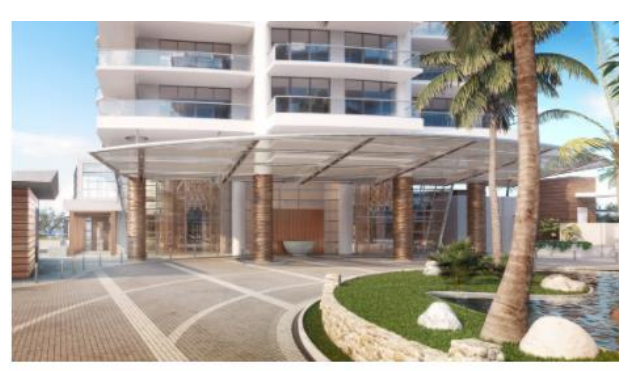
The grand entrance (project rendering)

One feature that will be a welcomed by residents, guests and local residents is the ocean-front restaurant and demonstration kitchen.