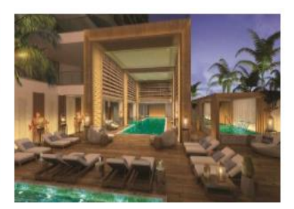
The spa pools