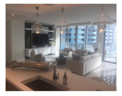
The units feature luxury upgrades throughout