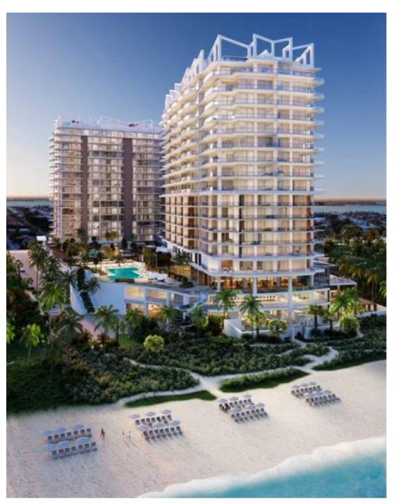
Amrit (project rendering)

Tower P features 182 residential units, priced upwards