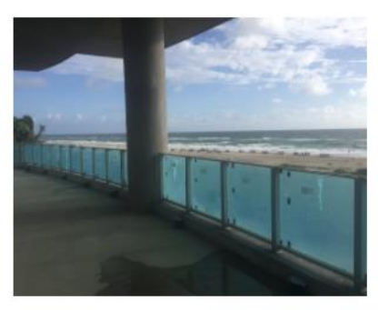
A spacious terrace to admire the ocean views