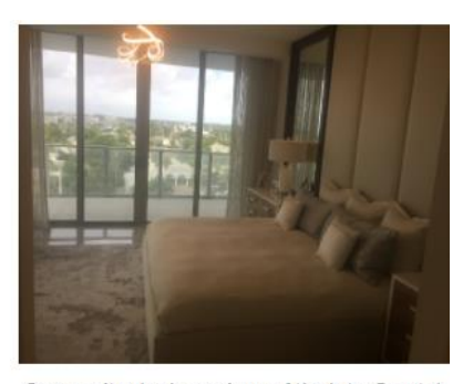
Some units also have views of the IntraCoastal