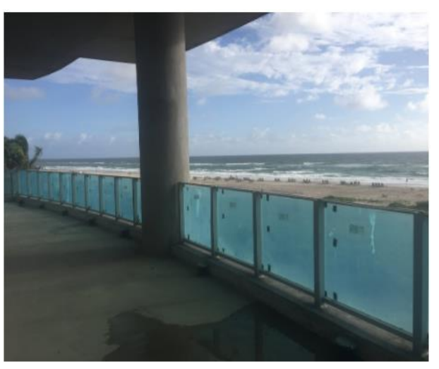
This is the view from the restaurant/bistro