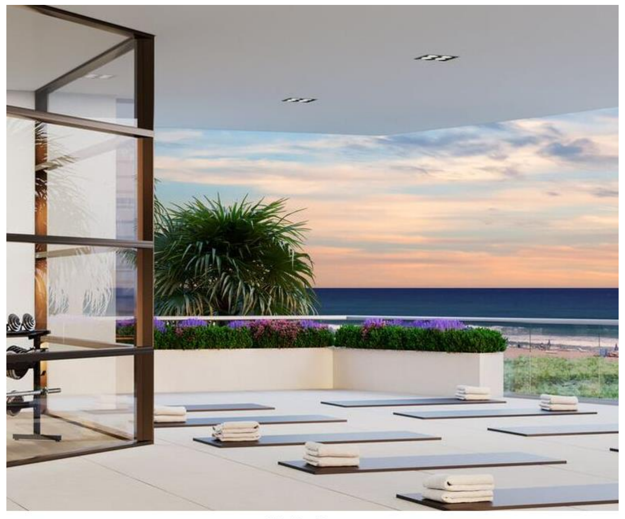
The Yoga Terrace